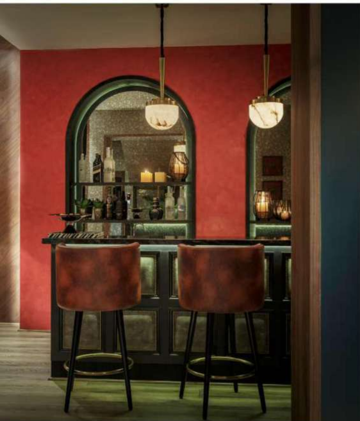
JHALANI RESIDENCE, NEW DELHI BY WITHIN

The bar back wall is highlighted with arches in crimson, customised by Oikos for Within and antique mirror. Adding warm cocoons on both sides, enveloped in rich veneer gives the bar a special touch. The shelving in veneer adds a lot to the space, while acting as a partition as well. The black and white tree ring abstract print on one end of the bar adds to the natural flavour of the wood in this area. And the blue mirror with onyx details raise eyebrows on the other end. Natural grains of alabaster in the pendants adds an extra touch of rich glamour. Comfortable bar stools in red leather echo the rich colour of the arches. (ON LEFT)